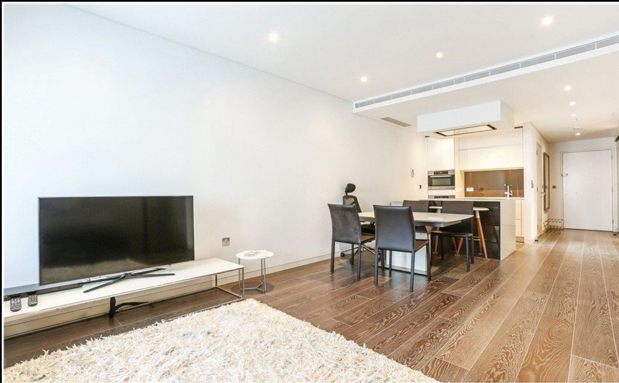
Marconi House, WC2R Guide of £950,000 Leasehold